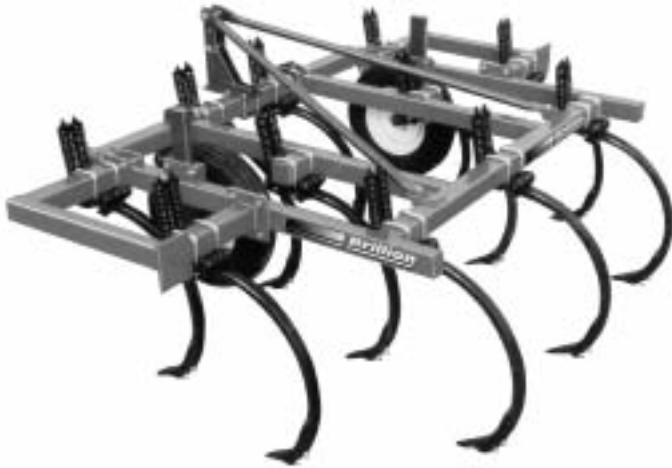
11 FT. MOUNTED CHISEL PLOW with 32 inch shanks and spring clamp assemblies with gauge wheels and reversible regular chisel points. Safety lights standard equipment.

Approximate Set Up Time: 1/4 hour per shank Drawbar Horsepower Required: 10-15 HP per shank